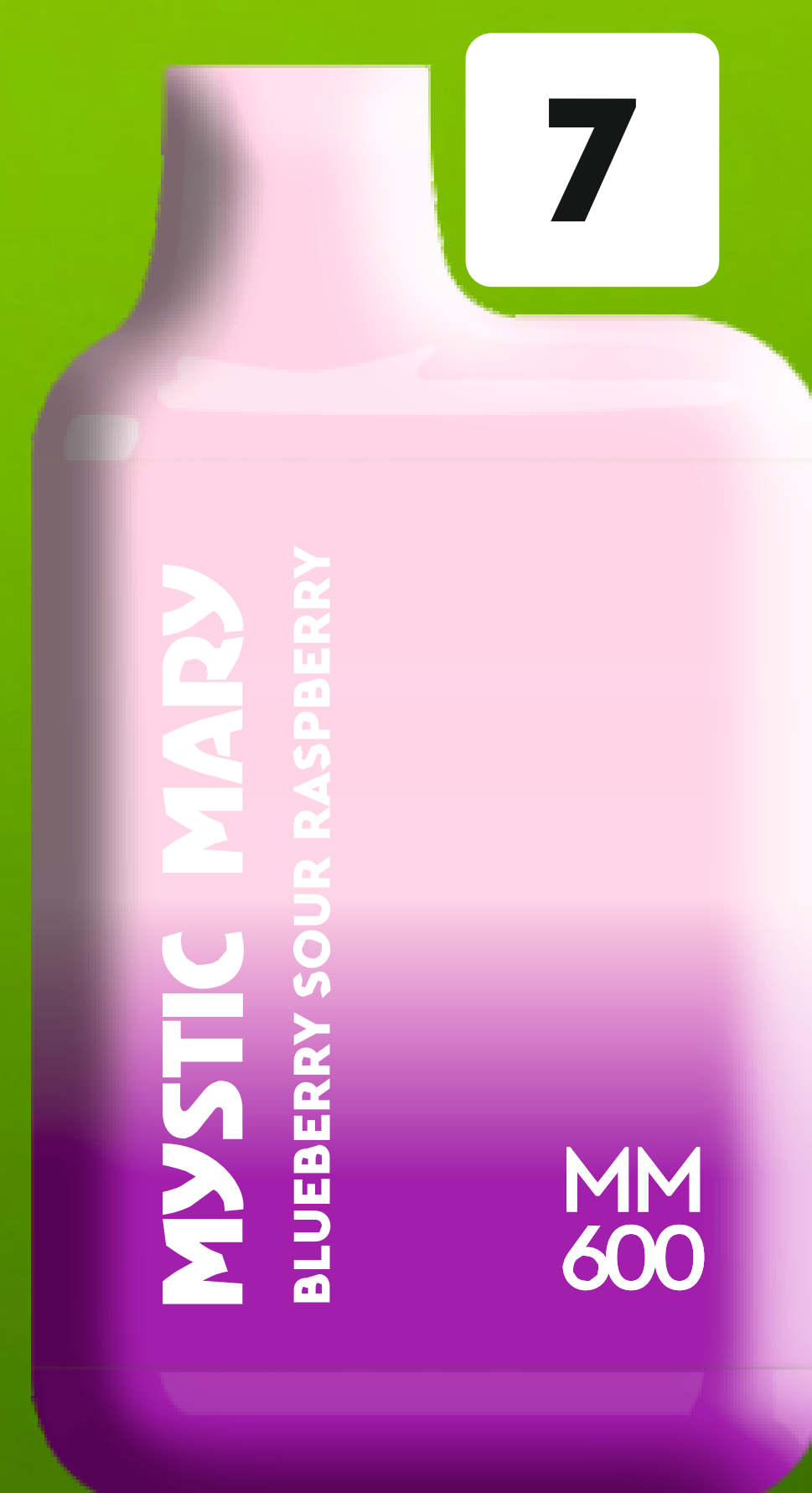
BLUEBERRY SOUR RASPBERRY