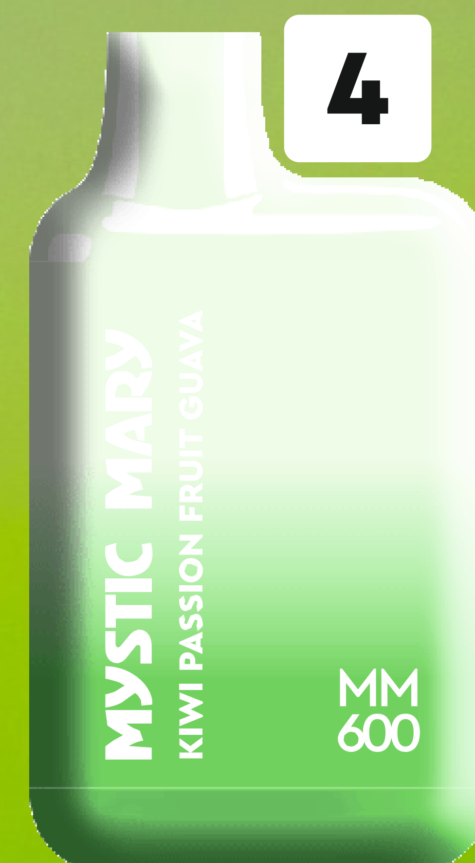
KIWI PASSION FRUIT GUAVA